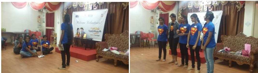
Student Volunteers performing at EP Forum 2015

On 11 th October, 2015, EP Forum 2015 , a talent forum for the volunteers of Endrum Punnagai was organised at Nila Party Hall, Chennai. It gave them the feeling of solidarity. It served as a platform for the volunteers to learn more about Endrum Punnagai activities through exploration and fun.