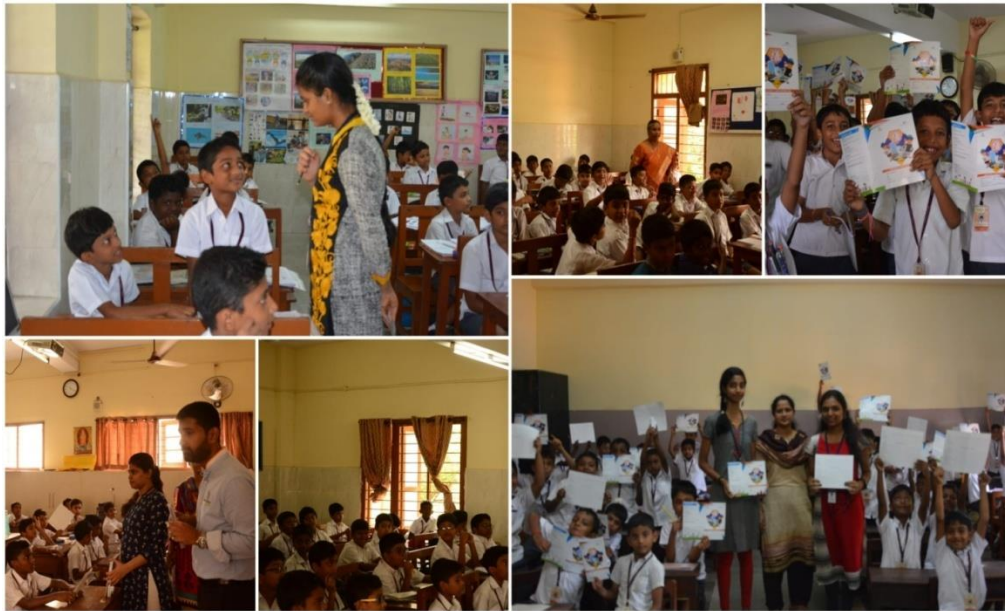
Road safety Class room Session in Don Bosco School

The Road safety vertical under Young India in collaboration with CII (Confederation of Indian Industry) conducted an event on 8 th of August, 2019 at Don Bosco School from 9 am to 11:30 am. Students from the department of bank management volunteered the event. The school students were addressed on road safety rules.