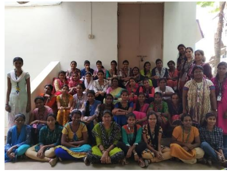
Certificate course program