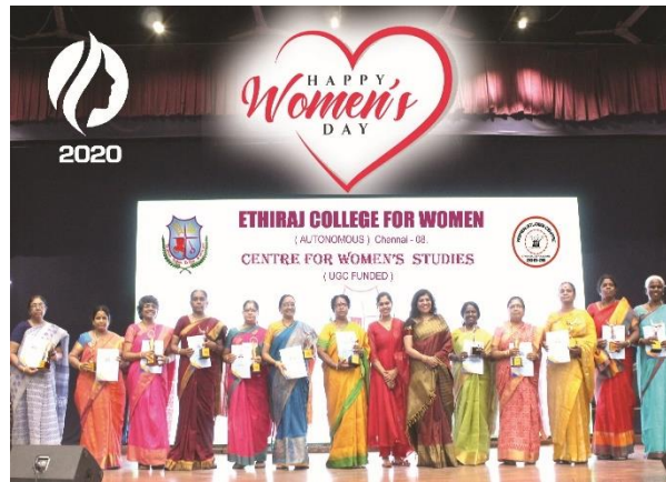
International Women's day celebration 2020