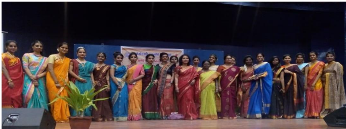
Fashion walk with handloom Sarees