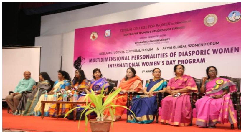
International Women’s day celebration 2019