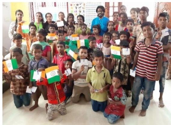
Celebration with the children at street vision NGO